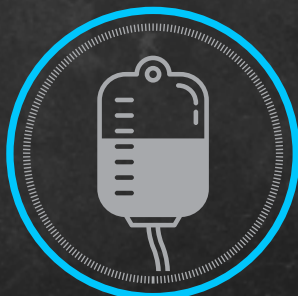
Unscreened blood transfusions