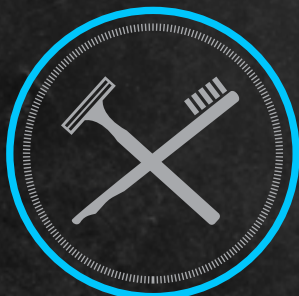
Sharing toothbrushes and razors

If you know how hepatitis is transmitted, you can reduce the risks: