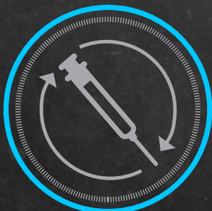
Sharing drug using equipment