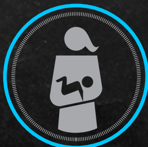
Mother to child