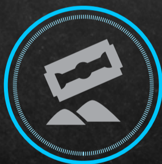
People who use drugs

Some groups of people are more at risk than others: