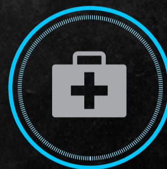
People who have undergone invasive healthcare procedures with inadequate safety practices