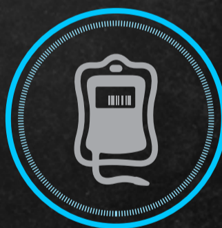
Recipients of blood transfusions